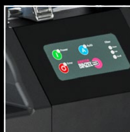
Control element FEC

The FEC works with the highly efficient cyclone technology and separates particles upstream from the filter. Therefore, requires less cleaning.